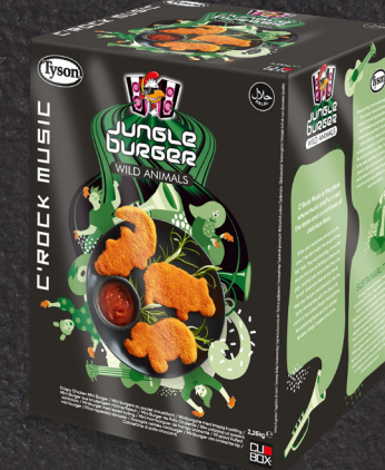
Jungle Burger Wild Animals