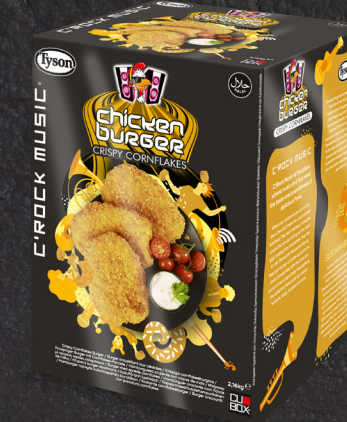
Chicken Burger Crispy Cornflakes