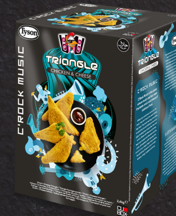
Triangle Burgers Chicken & Cheese