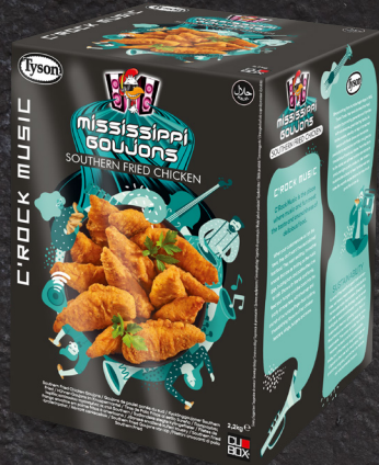
Mississippi Goujons Southern Fried Chicken

EU Cases/Pallet 21 Cases x 9 Layers = 189 UK Cases/Pallet 24 Cases x 7 Layers = 168