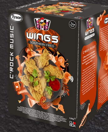
Wings Southern Fried