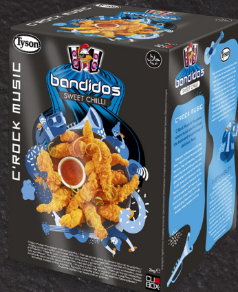
Bandidos Sweet Chilli

SKU CODE: 20001000505 PIECE SIZE: 15-25g