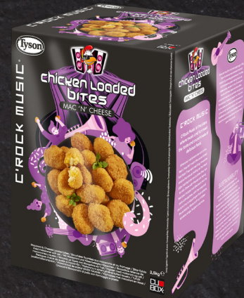
Chicken Loaded Bites Mac 'N' Cheese

SKU CODE: 20001000505 PIECE SIZE: 15-25g