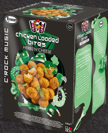
Chicken Loaded Bites Herbs 'N' Cheese