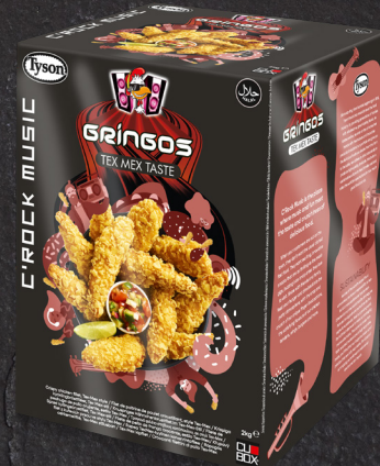
Gringos Tex Mex Taste