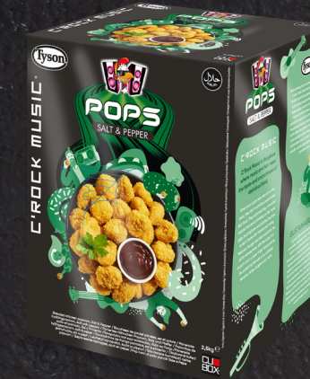
Pops Salt & Pepper