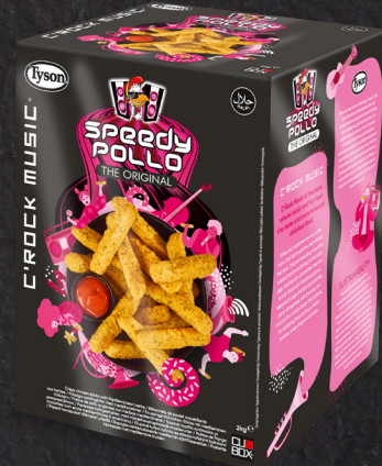
Speedy Pollo The Original